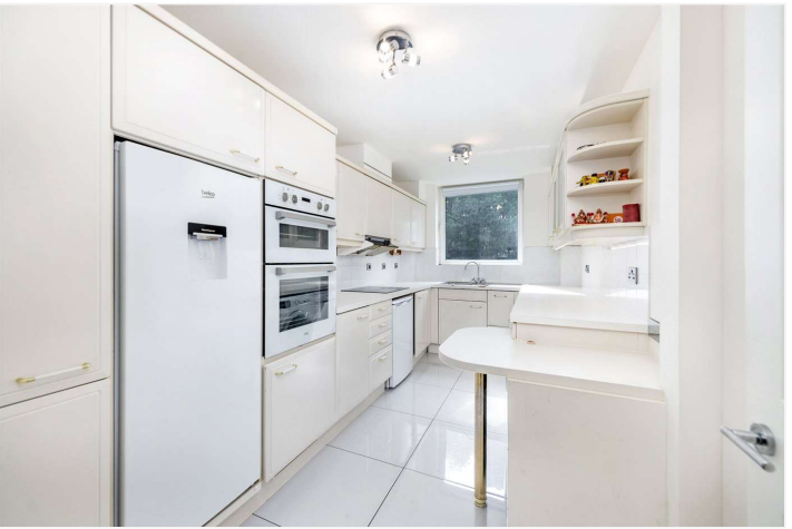
BALMORAL COURT, ST JOHN'S WOOD, LONDON, NW8 £1,200 PER WEEK FURNISHED

A bright and airy apartment on the first floor, benefitting from wooden floors throughout. Balmoral Court is a modern portered building with secure underground parking and is located 0.1 miles from St John's Wood Underground Station (Jubilee line).