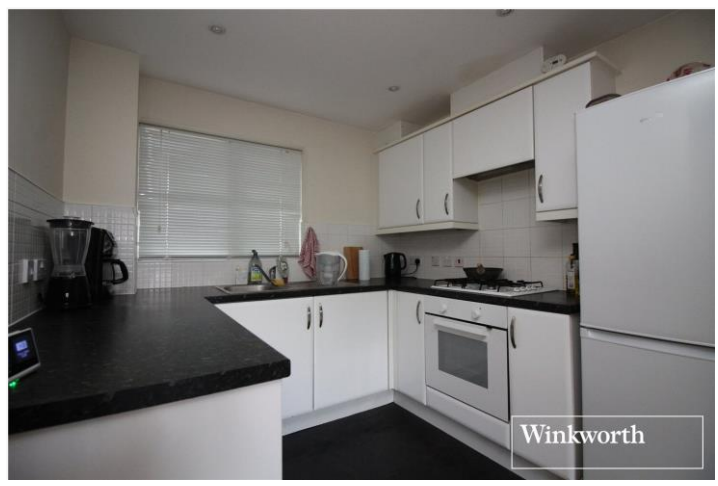
WHITEHALL CLOSE, HERTFORDSHIRE, WD6 £270,000 LEASEHOLD